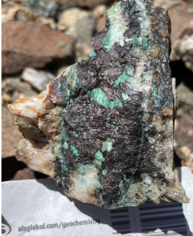
Photo #1 - Sample #E268328 from the "Au-Cu Adits" dump site. Massive, black, tarnished chalcopyrite (copper-iron sulphide) and green secondary copper mineral staining in a white quartz vein. Assayed 1.7 g/t Au. Copper and silver results pending. One of very many such pieces at this site, some assaying up to 17.9 g/t Au.