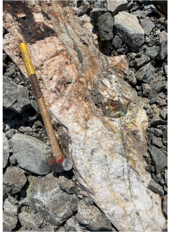
PHOTO 2: Newly discovered copper-stained quartz vein, ~70 cm wide, North West Claims

Burega continued, “the discovery of additional quartz veins of substantial size on the North West claims in the vicinity of historic showings was another highlight of the summer program. Romios personnel also completed several weeks of exploration work on three of our projects in NW Ontario and a summary of that work will be forthcoming shortly.”