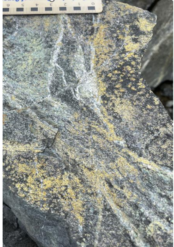
PHOTO 1: Chalcopyrite (copper sulphide) covered fractures on boulder along Trek South IP survey line.